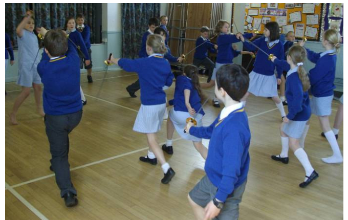
Rehearsals in the Burnside Hall.

Everybody is thrilled about the performance.